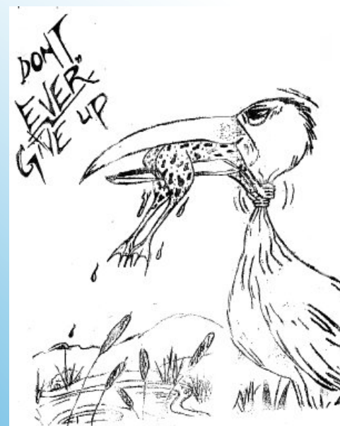
An endplay squeeze